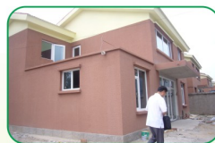
State of the building in Beijing's shunyi District after roof-sealing has been finished