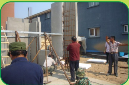
工程现场负责人指导工人现场安装墙板