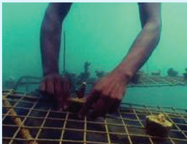
Coral replanting