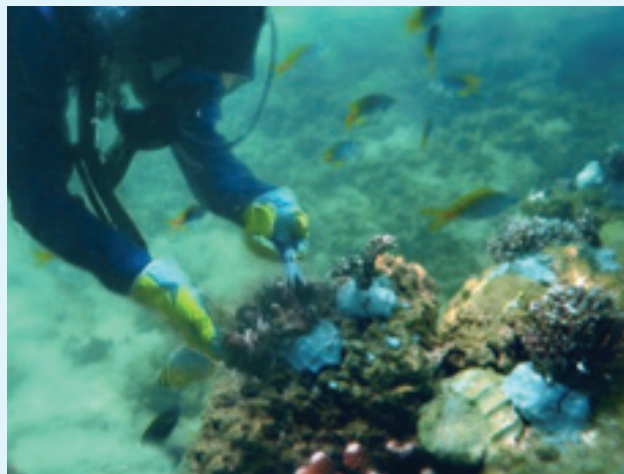
Community coral restoration and replanting (top and above), Sri Lanka: photo courtesy of the SGP-Sri Lanka