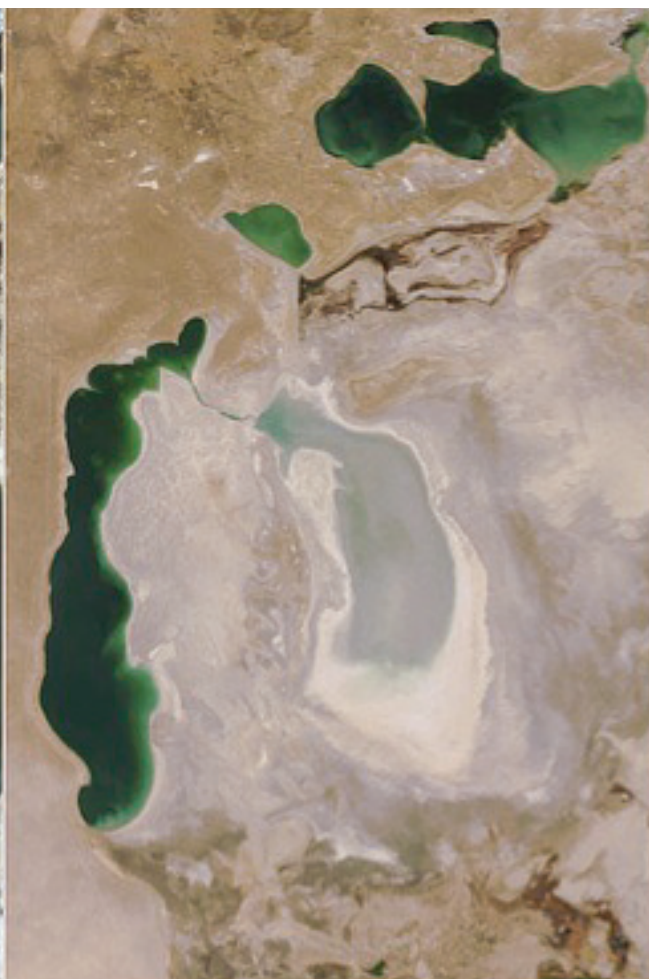
OCTOBER 5, 2008

The Aral Sea