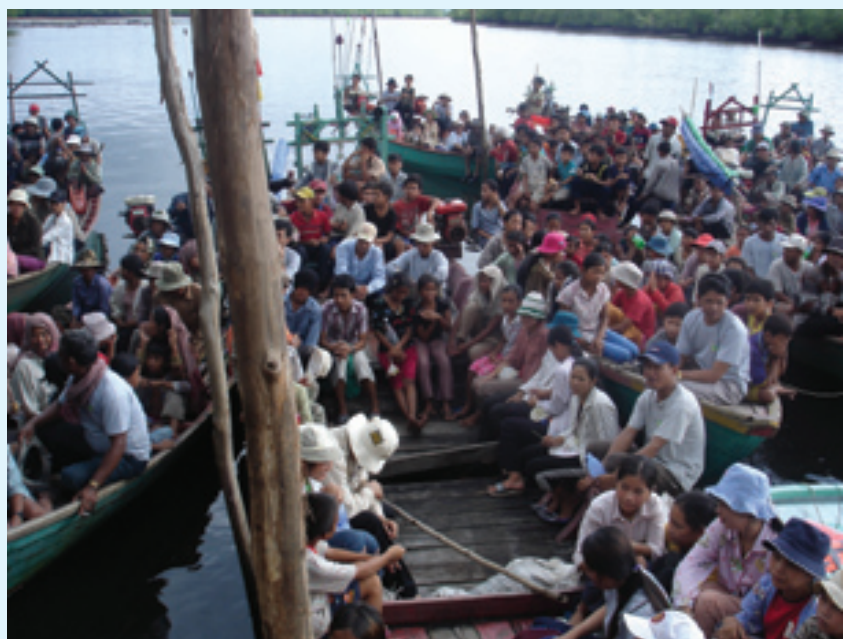
Mangrove and seagrass rehabilitation, protection, and conservation for livelihood improvements, Cambodia