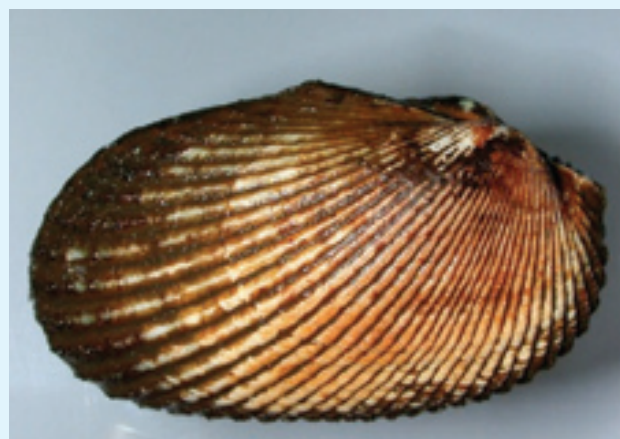
Restored mollusk populations. Both the Anadara Tuberculosa (left) and Anadara Similis (right) populations were controlled by allowing populations to grow in corrals and not be collected until certain sizes were reached: photo from: National Biological Information Infrastructure, Ecuador.