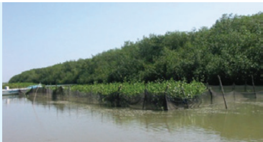
Protection of mangrove swamp: photo courtesy of SGP-Ecuador