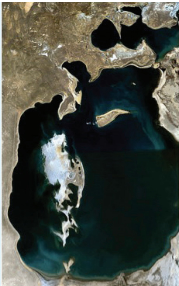
JULY – SEPTEMBER, 1989