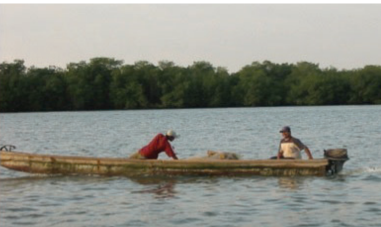
Fishing off Costa Rica Island