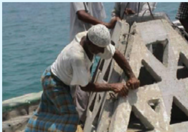
Artificial reef construction – locals poured concrete into models to create triangular pieces (above) which were weighted to the sea floor and later became the perfect habitat for corals (below), photos courtesy of Mr. Sharif Ranjbar.