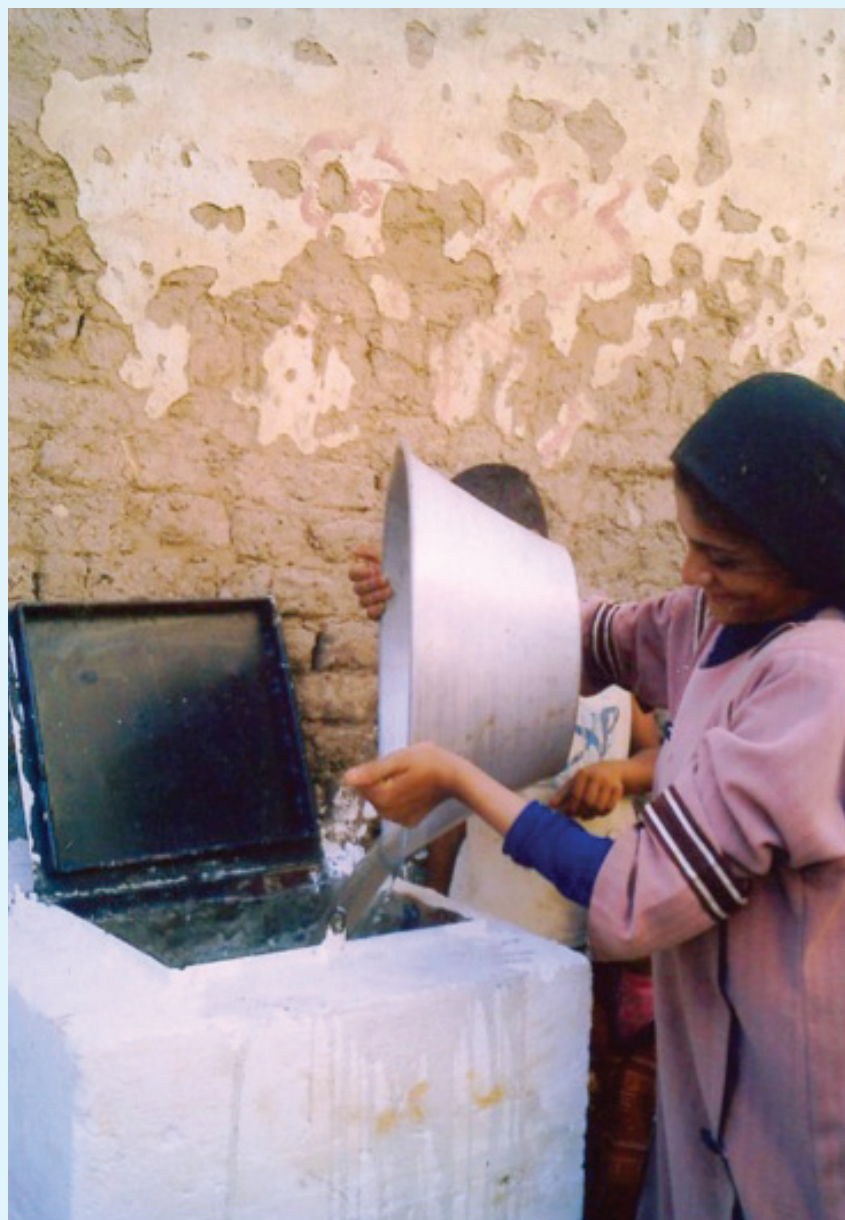
Grey water treatment and protection of fresh water sources, Nile River