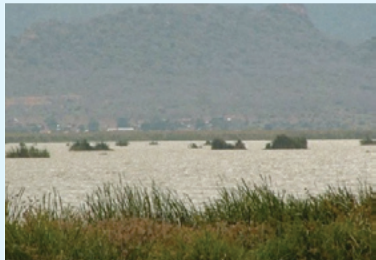
Lake Jipe before and after restoration activities: photos courtesy of SGP-Kenya Before the project (left), Lake Jipe was drying up and inundated with cattails. Rehabilitation through SGP supported projects raised water levels (right).